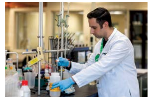
The scientists and chemists at our certified lab perform hundreds of water quality tests each day to ensure the safety and quality of our drinking water.

At PWSA we employ rigorous monitoring and testing procedures to ensure the continued delivery of clean and safe water to your home or business. Our 2022 Annual Water Quality Report, released in June 2023, found that PWSA meets and exceeds all regulatory requirements and in July we reported the lowest lead levels in decades. At 3.4 parts per billion (ppb), our corrosion control continues to be effective in keeping lead levels low for those who still have lead service lines or internal lead plumbing.