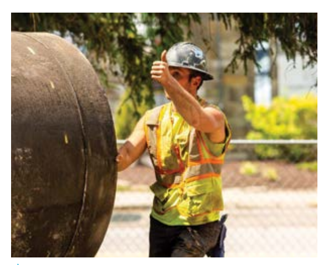
The rehabilitation of Rising Main 4, completed in 2023, strengthens our water distribution system and will reliably serve customers for years to come.

New rates, going into effect on February 15, 2024, will enhance customer assistance, offer a one-time rain barrel credit, and provide funding to advance infrastructure investment.