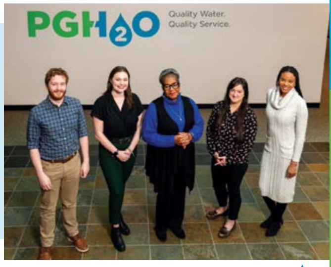
The PGH2O Cares team builds awareness and enrolls incomeeligible customers in our financial assistance programs.