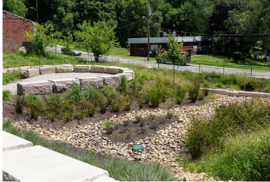
Hillcrest Stormwater Project in Garfield

The Hillcrest Stormwater project, completed in 2018, is helping to reduce stormwater runoff in the Garfield neighborhood. Residents are interested in seeing more green infrastructure in their community and are curious about how they can help manage stormwater on their own properties.