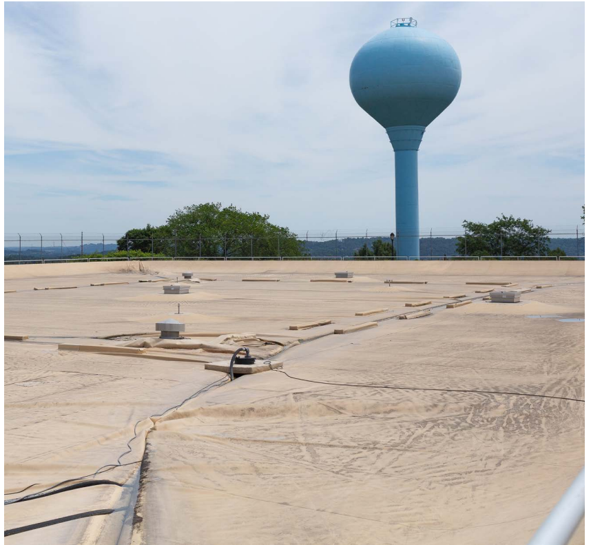
Herron Hill Reservoir, with the Herron Hill Tank in the background, before repairs.

We expect this project to be complete in January of 2020.