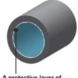
A protective layer of Orthophosphate forms to prevent pipe corrosion.

Orthophosphate has created a protective barrier in lead pipes to reduce lead levels in drinking water.