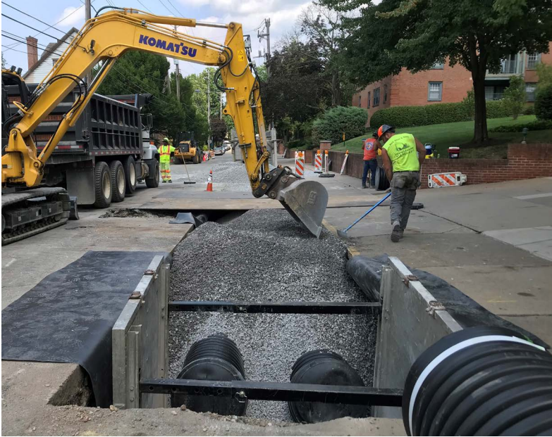
PWSA crews installing underground stone storage before laying permeable pavers at the Maryland Avenue Stormwater Improvement Project .

Since 2017, we have increased investment in water, sewer, and stormwater infrastructure. The past several years focused on the replacement of lead service lines, with the greatest amount of capital spending being allocated to the water distribution system. We are now also turning our attention to other essential water, wastewater, and stormwater projects that are necessary to revitalize and secure Pittsburgh's water future.