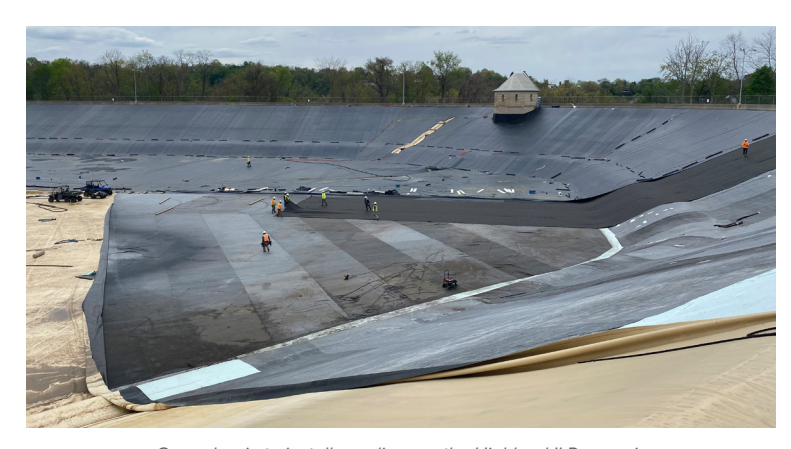
Crews begin to install new liner on the Highland II Reservoir.

This spring, PWSA embarked on a $24 million investment in its covered reservoir, located in Highland Park. Constructed between 1897 and 1903, the Highland II Reservoir supplies water to portions of Squirrel Hill, Downtown, South Side, and