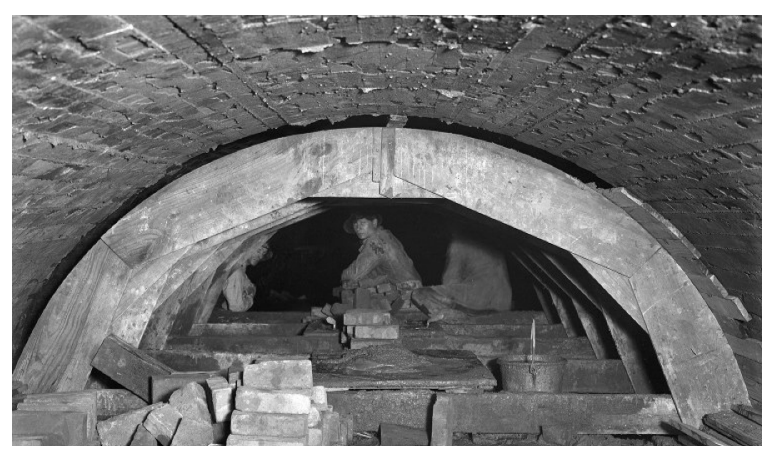
Historic image of PWSA sewer being constructed

Over the coming years, PWSA will rehabilitate large diameter sewer mains 36-inches in diameter or more to fortify the structural integrity of the sewer pipes we rely on each day,