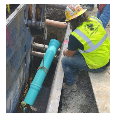
Contractor crews installing the new sewer main on Fuchsia Way in Homewood

The Fuchsia Way Sewer Reconstruction Project is a community-focused solution that will improve the reliability of water and wastewater services in Homewood. For more information, please visit the Project webpage.